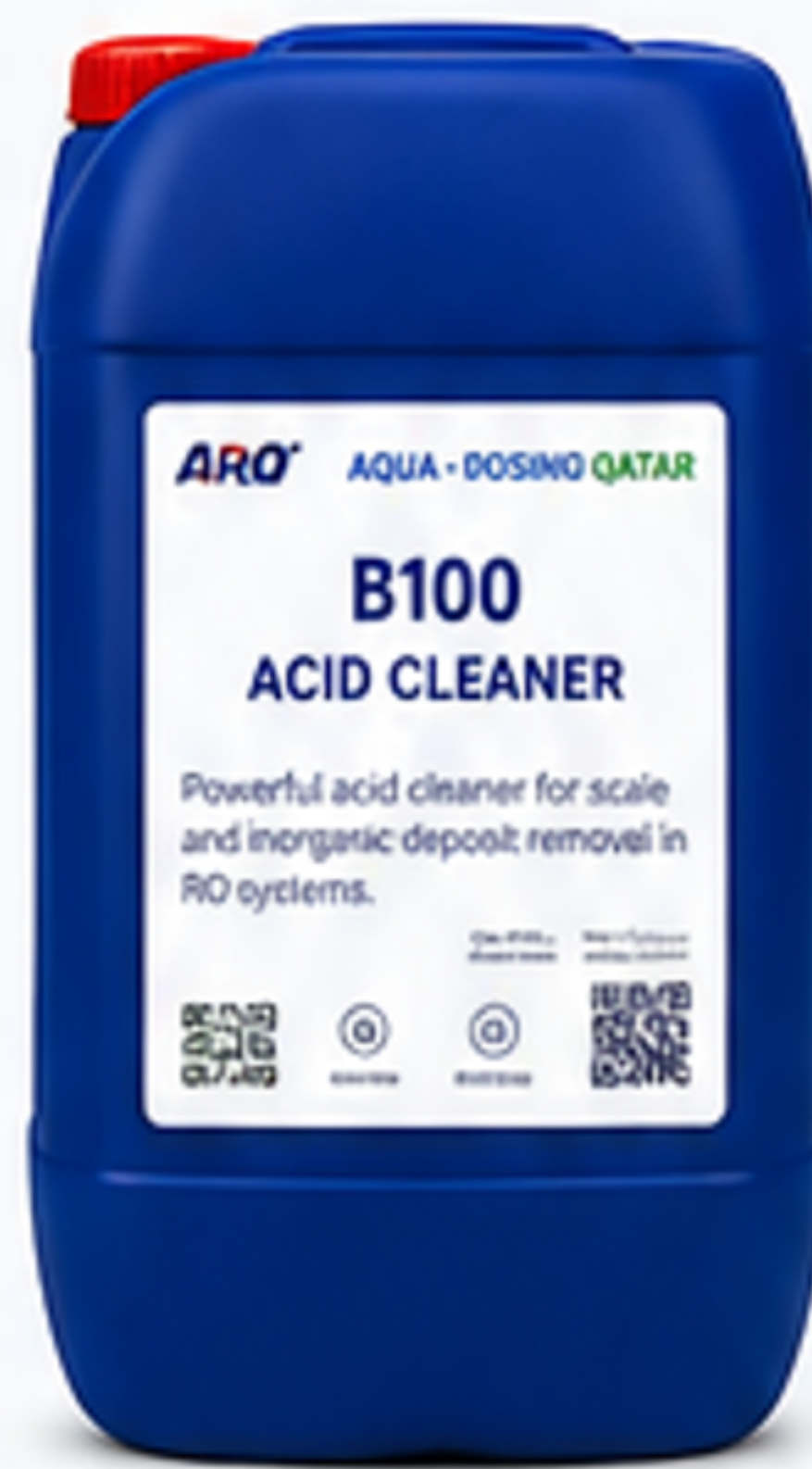
B100 Acid Cleaner