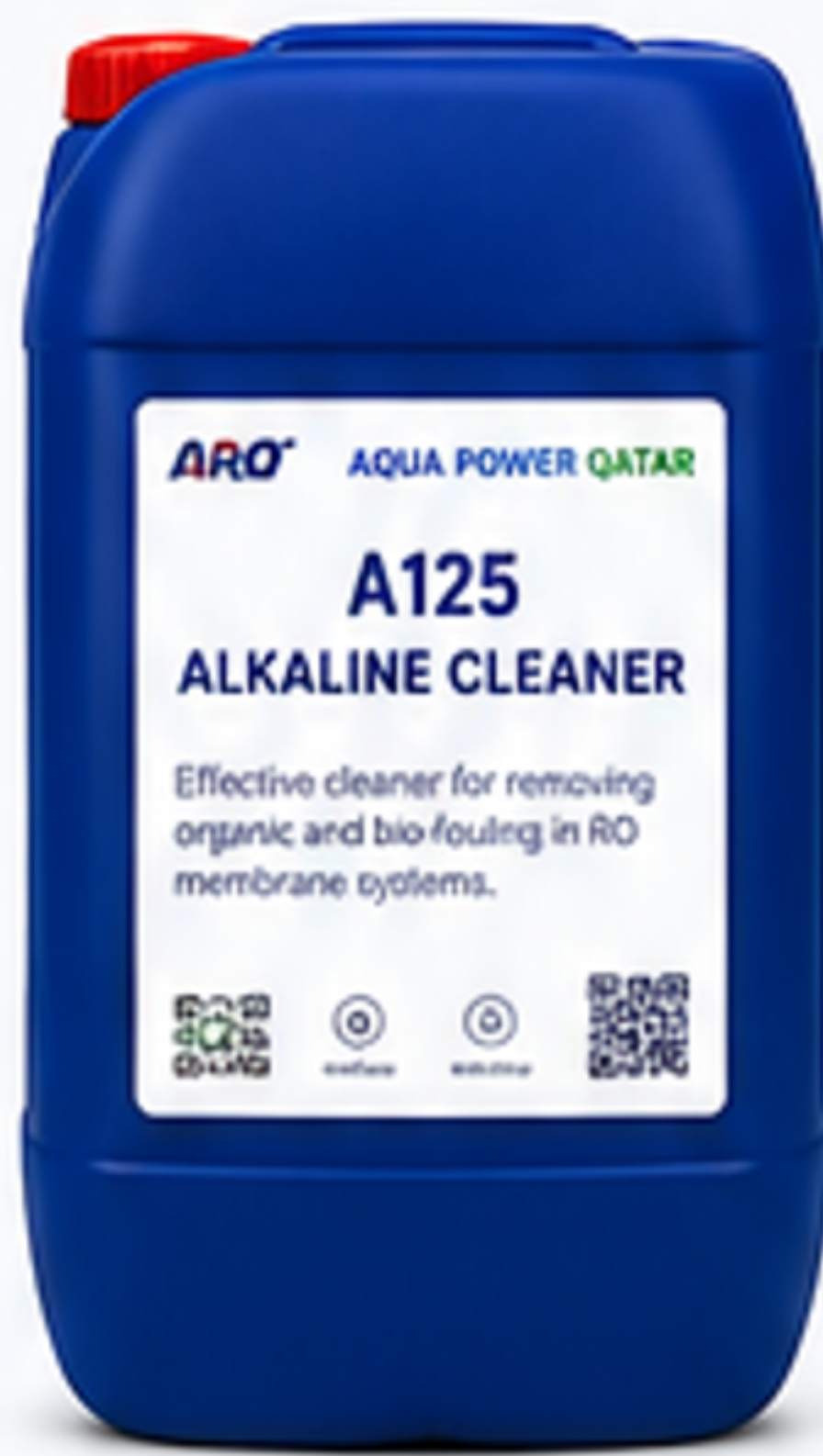
A125 Alkaline Cleaner